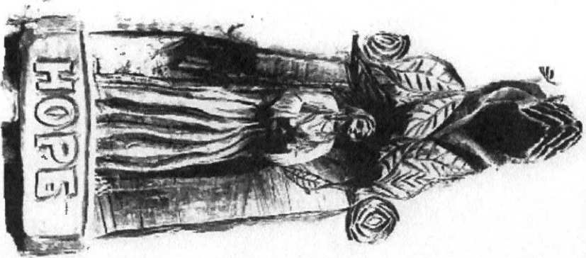
Tree carving in the churchyard at Fenit, Stk. Ireland.