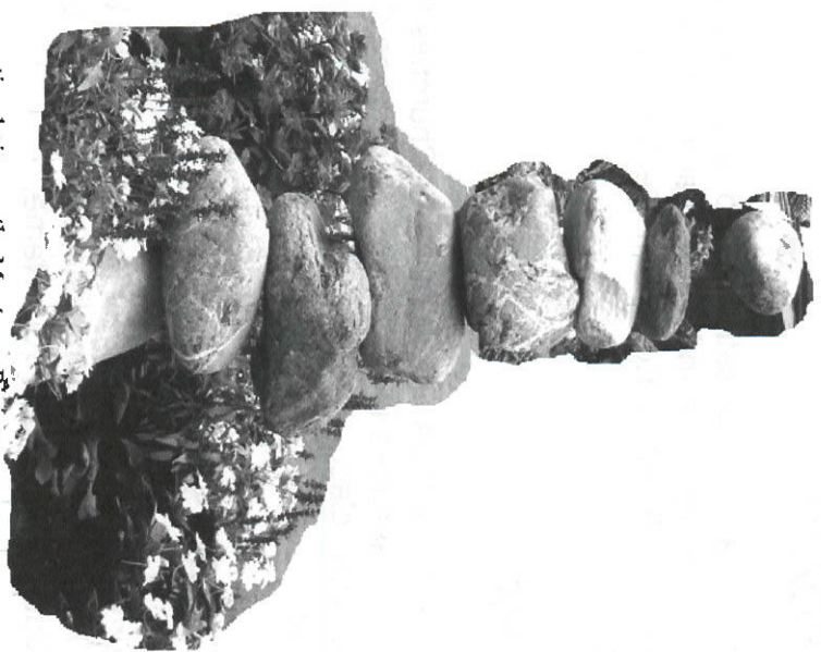
From an evocative design on the Montreux Kiorera

Prayer knows no boundaries, needs no editing, requires no qualifications and is open to all, powerful and rewarding.