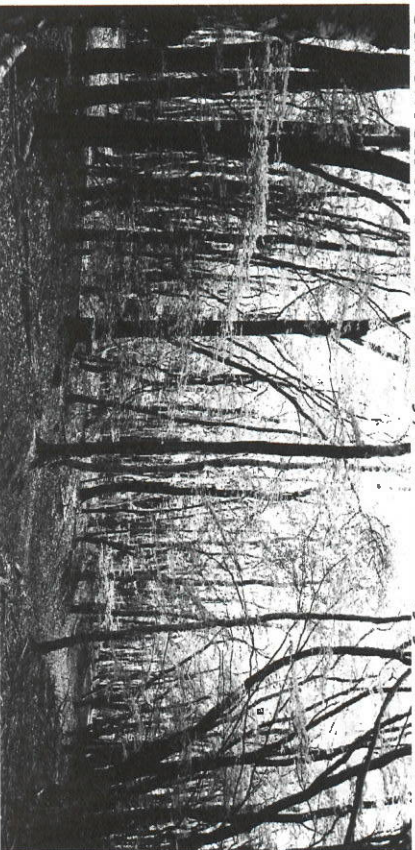
Open woodland, Poyys

This poem is taken from 'Piazza', a magazine published by Kingswood School in 1948, three years after the end of WW2; we have reprinted it as a reflection on the current state of the country, over seventy years later!